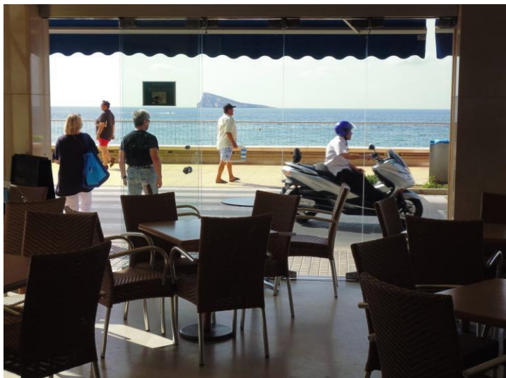
View from “ Marconi ” Hotel.

The three official Hotels, “ Marconi ”, “ Golden ” and “ Magic Villa del Mar ”, are located in the main commercial street of Benidorm, in a safety and fun touristical area of Benidorm city, not more than 8 km from venue site in La Nucia.