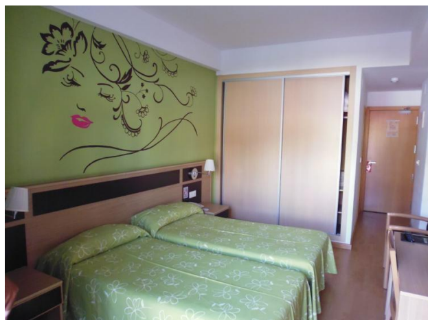
Room at “ Hotel Golden ”

Complementary Hotels are “Golden” and “Marconi”, both located around 80 metres from “Magic Villa del Mar”, are also in the Poniente Beach.