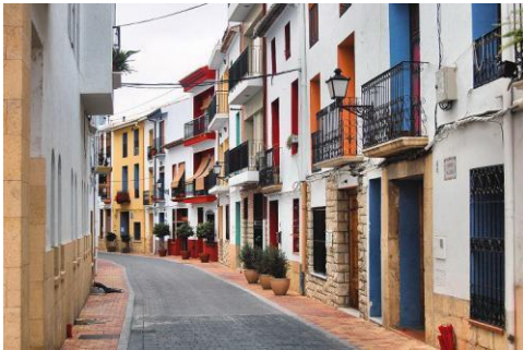
Street in La Nucía

La Nucía is located in a fruit valley between Benidorm and Callosa d'En Sarrià, 3 km from the coast of Altea. The urban center is on a promontory overlooking the Mediterranean Sea, 51 km north of Alicante Airport and 8 km north of Benidorm. Population (with over 80 different nationalities, mainly europeans) are 17.000 citizens.